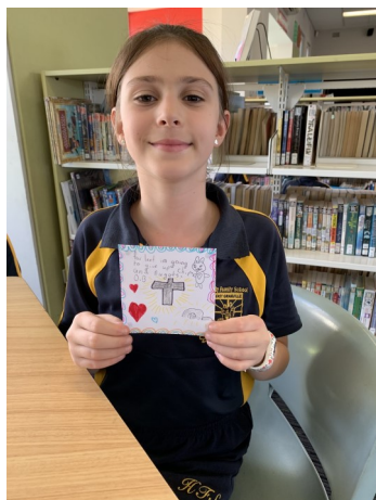
'I am giving up bread, fish, chocolate and KFC'

In the scripture passage, we learnt that Jesus' disciples had to trust in him to calm the storms, and so we have to trust in Jesus' when things don't always go our way.